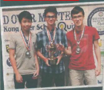
First runners-up from Island School (above) lost out to the FIS team (right).