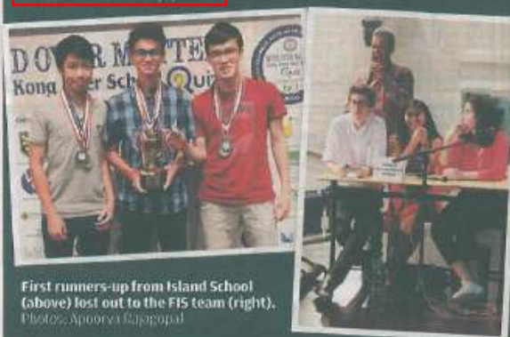
First runners-up from Island School (above) lost out to the FIS team (right).

8 Yr, Odín, Thor and Frigg were Norse gods. How do we remember them today, along with the Sun, the Moon, and the Roman counterpart of the Titan Cronos?