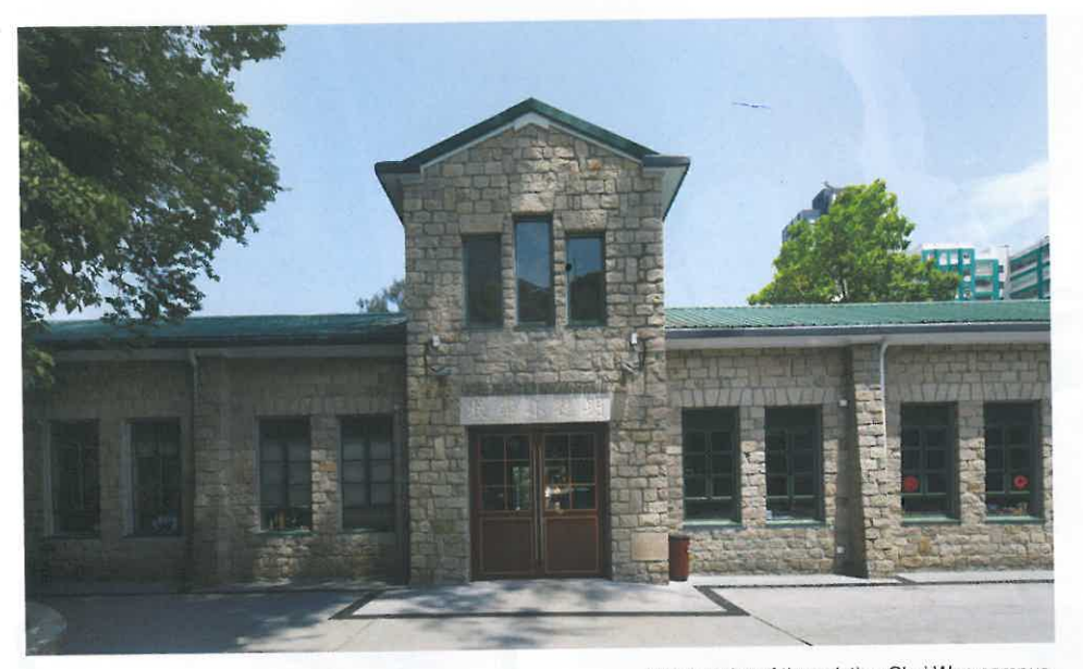
The exterior of the existing Chai Wan campus.

The villa concept offers a new way of learning for FIS students. "There will be three classes of the French stream and two classes of the International stream sharing a villa", explains Clayton. In the middle is the Agora: the shared area. The walls separating each room will be retractable and students will share a large area in the middle of the villa where they can experience intercultural